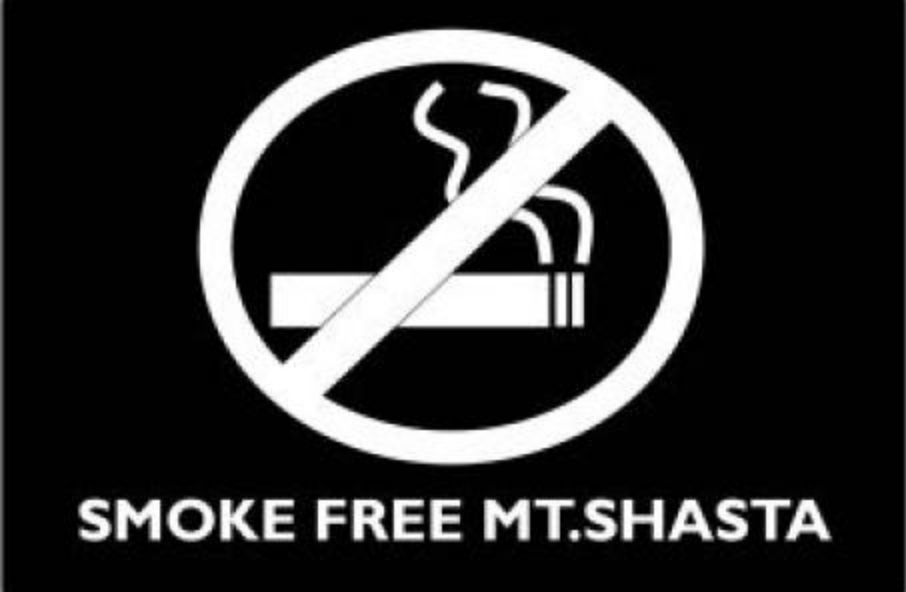
Smoke Free Mt. Shasta