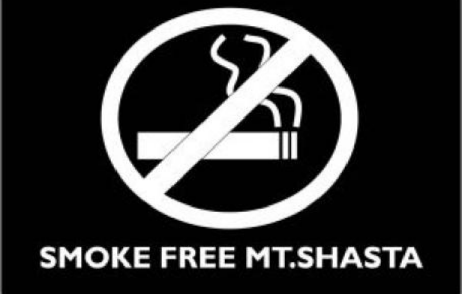
Smoke Free Mt. Shasta